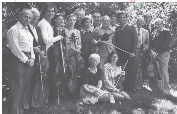
The Highland Park Strings, 1979-1980 Season

"The Highland Park Strings is loved as much as it was...when a group of musicians first played classical string music for the community."