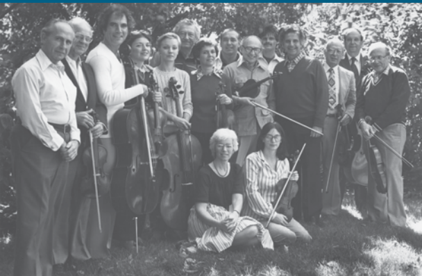
The Highland Park Strings, 1979-1980 Season

"The Highland Park Strings is loved as much as it was...when a group of musicians first played classical string music for the community"