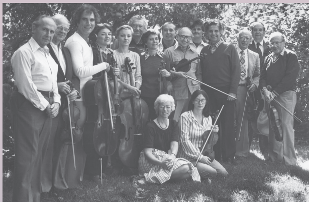
The Highland Park Strings, 1979-1980 Season