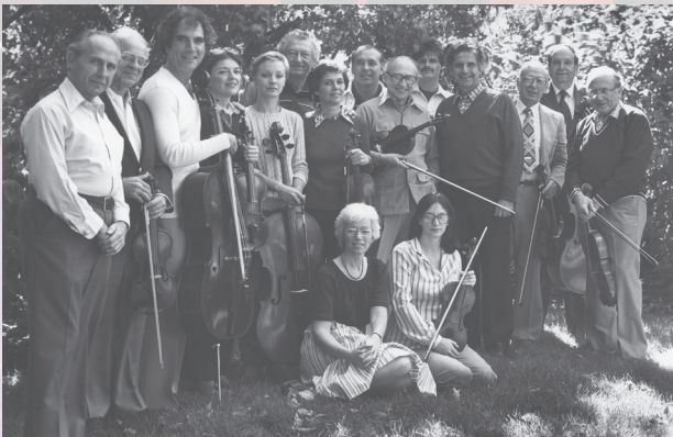
The Highland Park Strings, 1979-1980 Season

"The Highland Park Strings is loved as much as it was...when a group of musicians first played classical string music for the community."