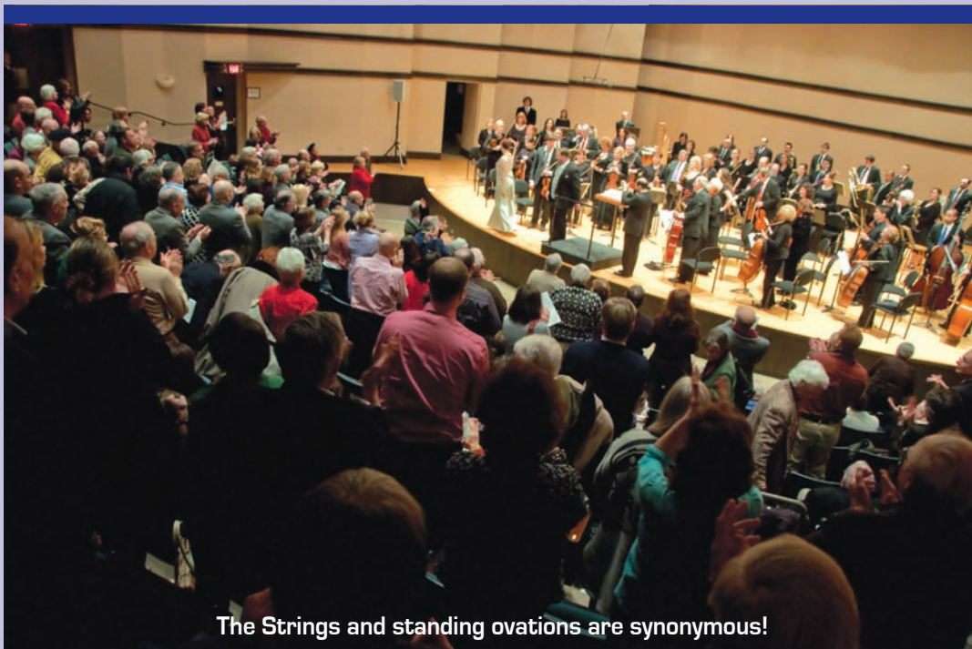
The Strings and standing ovations are synonymous!

He and his wife reside in Chicago with their two small children.