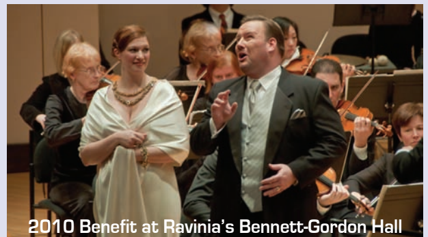
2010 Benefit at Ravinia's Bennett-Gordon Hall

Complimentary tickets will be mailed with benefit tickets.