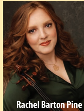
Rachel Barton Pine